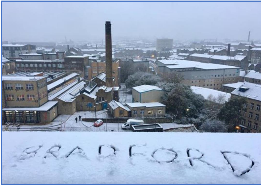
Bradford: Resplendent in winter